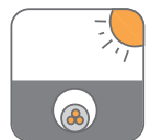
Laid In Ducts